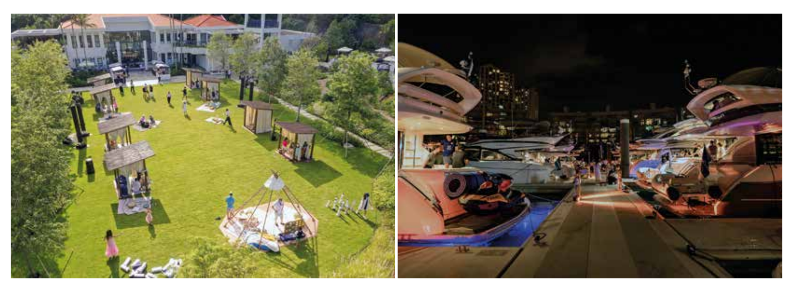
The seaside lawn (left) in front of the clubhouse is a picturesque outdoor venue for events; the marina (right) is suitable for yacht builder or dealer events

"Lantau Yacht Club is an inspiring venue for all types of events thanks to the unique backdrop of the marina, the South China Sea and the lush, green surroundings. DB is just 25 minutes from Central by ferry and the uniqueness of the venue makes it worthwhile to make a trip here," Ho says.