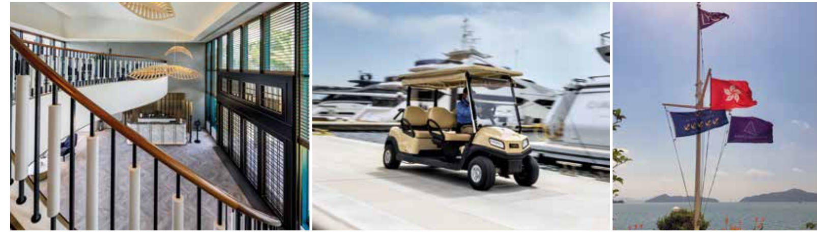
The clubhouse (left); the marina's main piers are 5m wide (middle); the club proudly flies the 5 Gold Anchor flag (right)

On land, the marina accommodates smaller boats and jetskis on the hard stand (up to 17m) and in the dry-stack facility (up to 8m), and offers storage options in 20ft and 40ft containers, as well as lockers. Services include bunkering, haul-out, repair and maintenance for members and visiting members, with hardware including a travel lift (45 tonnes) and forklift (10 tonnes).