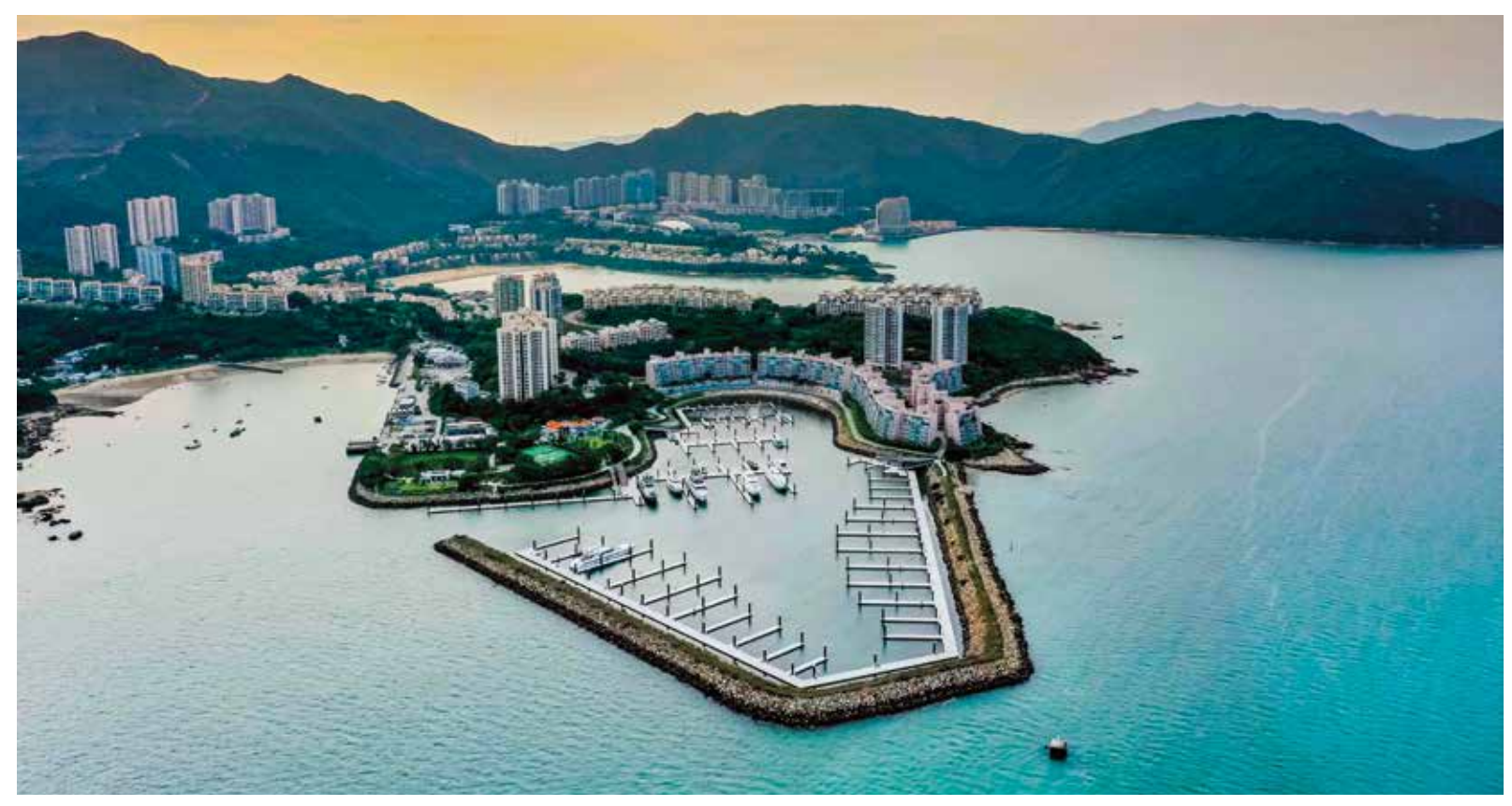
Lantau Yacht Club received a 5 Gold Anchor accreditation from the Marina Industries Association on its first anniversary since its soft opening in September 2020

antau Yacht Club has kicked off its second year in style by becoming the first marina in Hong Kong to receive Gold Anchor accreditation from the Marinas Industries Association ■ (MIA). The typhoon-sheltered marina was awarded 5 Gold Anchor status, a rating held by just over half of the Global Gold Anchor Program's 200-plus marinas in over 30 countries.