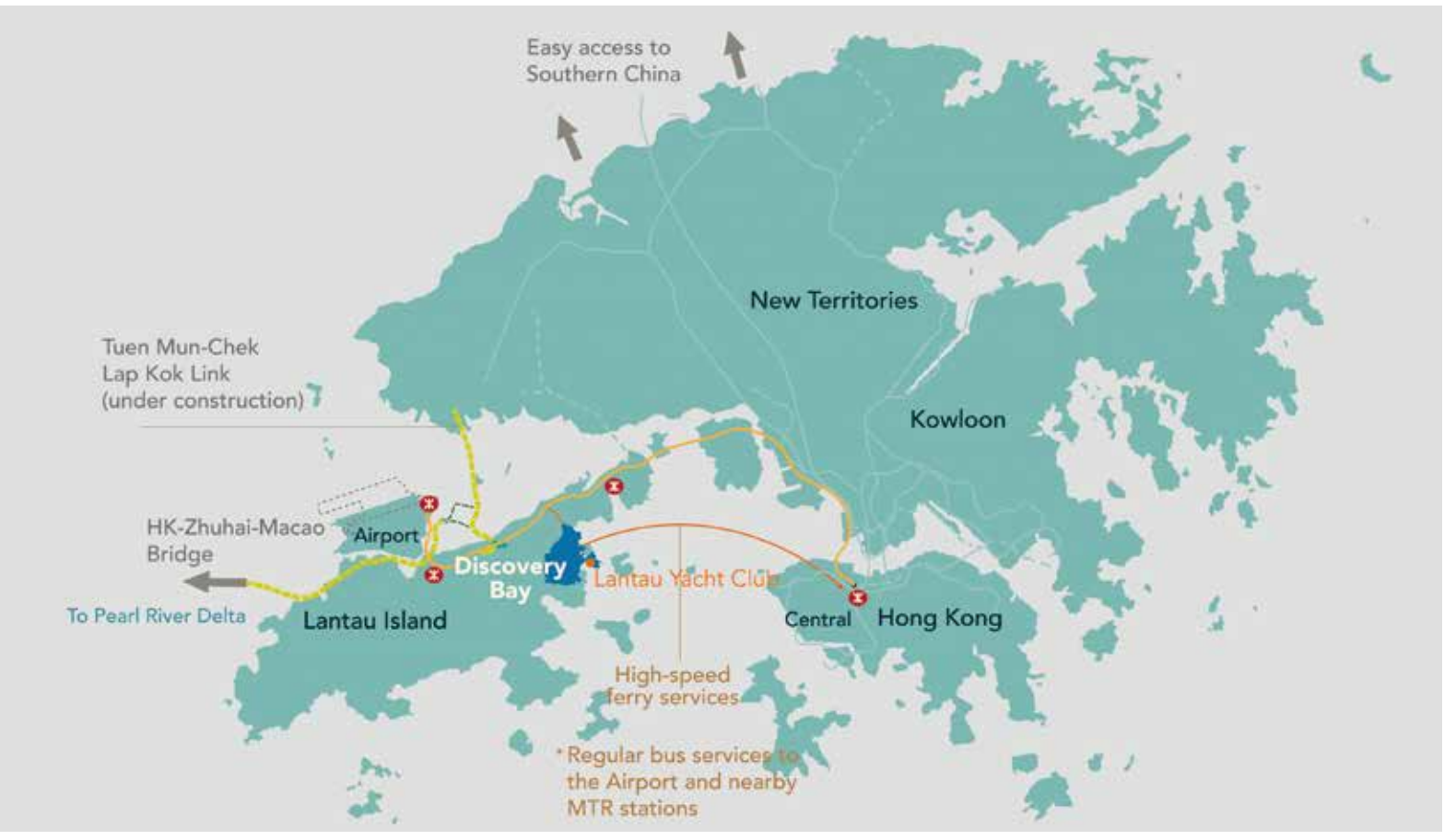
Located in Discovery Bay, Lantau Yacht Club has quick access by ferry to Central and by road to two MTR stations, Hong Kong International Airport and the HK-Zhuhai-Macao Bridge

"Due to the scarcity of berths for supervachts in Hong Kong, many DISCOVERY BAY AS DESTINATION vacht owners become a member in order to reserve a berth before they Lantau Yacht Club's clubhouse and facilities are only for members. purchase a vacht or because their vacht is still in build," Ho says. who are entitled to privileges at the 27-hole Discovery Bay Golf Club, The large number of available berths seems at odds with most Discovery Bay Recreation Club, Club Siena and Auberge Discovery other marinas in Hong Kong, a city where places to keep a yacht are Bay Hong Kong, a seaside resort hotel. at a premium, but this exclusive private club is pursuing a targeted Located in the northeast of Lantau, a 25-minute ferry ride from