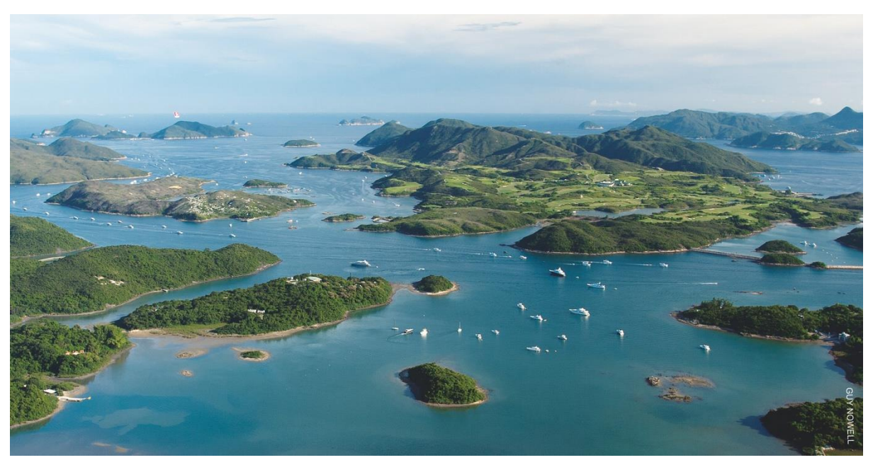
Port Shelter, Sai Kung: one of the most popular cruising grounds in Hong Kong.

As the latest exclusive private yacht club in Asia, LYC's membership is strictly by invitation only. Members of the Club will be among the few privileged to experience the luxury and leisurely lifestyle of Discovery Bay, an upscale resort-style community. Apart from the LYC clubhouse, Marina and service yard, members can enjoy a series of special offers and exclusive access to the facilities at the clubs and hotel in Discovery Bay; including the 27-hole golf course at the Discovery Bay Golf Club, comprehensive sports and leisure facilities of Discovery Bay Recreation Club, the infinity pool at Club Siena, and the spa and delicacies at the seaside resort hotel, Auberge Discovery Bay Hong Kong.