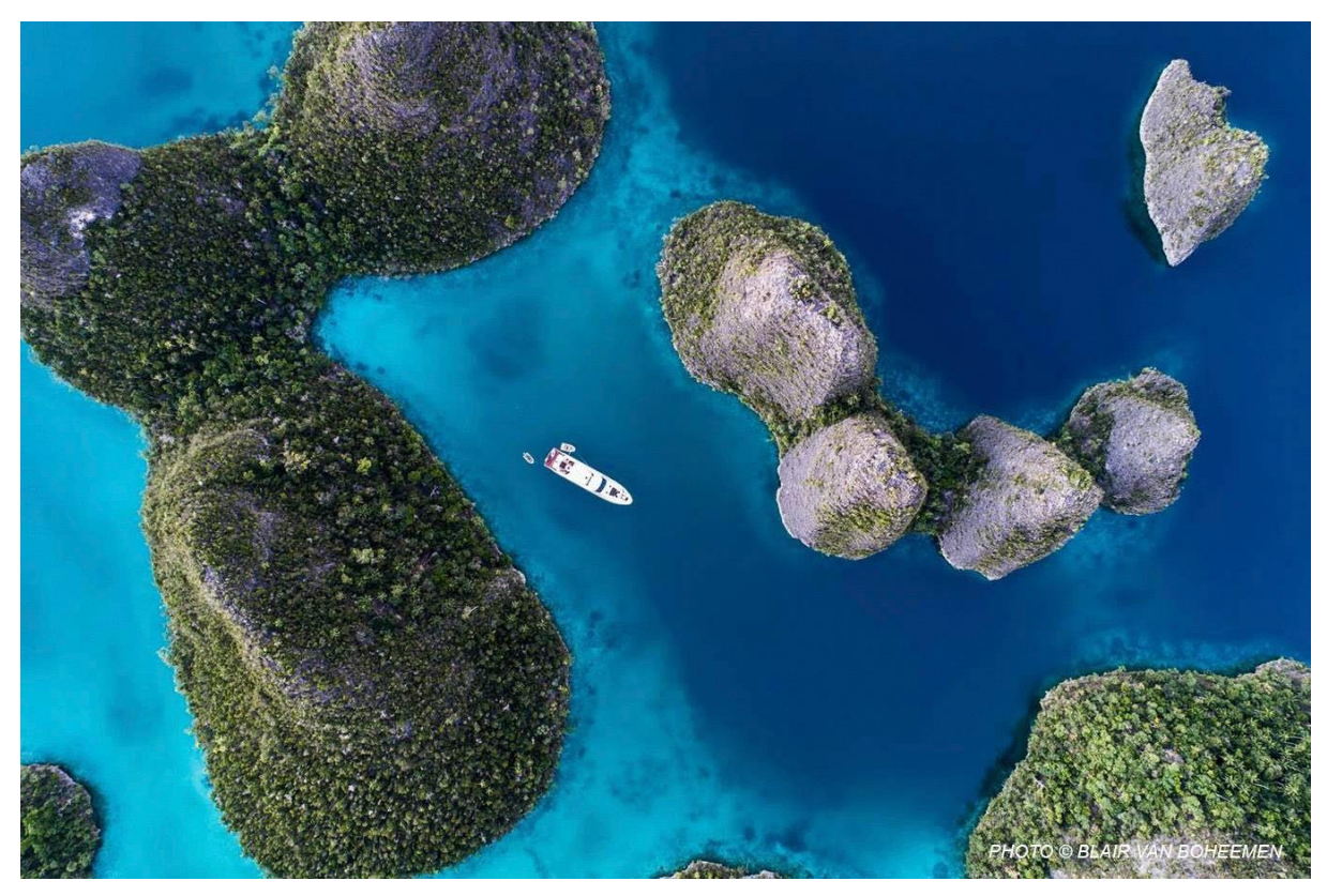
Indonesia is among the hottest exotic southeast Asian destinations for superyachts.

Continual improvement in infrastructure and a growing number of yacht clubs are encouraging a growing number of Asian ultra-high-net-worth individuals ("UHNWIs") to get on board the nautical lifestyle. In fact, there has been a substantial uptake in yachting in Asia in recent years, driving both marine tourism and yacht chartering.