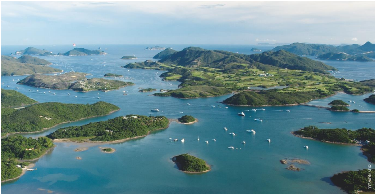
Port Shelter, Sai Kung: one of the most popular cruising grounds in Hong Kong.

As the latest exclusive private yacht club in Asia, LYC's membership is strictly by invitation only. Members of the Club will be among the few privileged to experience the luxury and leisurely lifestyle of Discovery Bay, an upscale resort-style community. Apart from the LYC clubhouse, Marina and service yard, members can enjoy a series of special offers and exclusive access to the facilities at the clubs and hotel in Discovery Bay; including the 27-hole golf course at the Discovery Bay Golf Club, comprehensive sports and leisure facilities of Discovery Bay Recreation Club, the infinity pool at Club Siena, and the spa and delicacies at the seaside resort hotel, Auberge Discovery Bay Hong Kong.